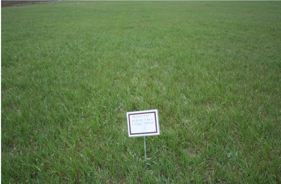
Figure 2. Taller smooth brome was noted in wheel-tracks, Garrison, NE, 2012