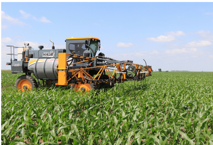
Figure 1. UNL high clearance applicator for in-season application for this study.

All cooperating producers will receive $1,300 per study in recognition of their time and resource commitments and to mitigate the risk of potential yield loss.